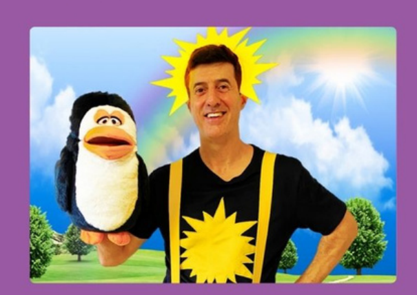
Sunny and Penny's Energy Saver Show (4-7years) at Chatswood and Northbridge Libraries.

Visit our website to register, and for more information on upcoming events. <a href="mailto:libraries.willoughby.nsw.gov.au">libraries.willoughby.nsw.gov.au</a>