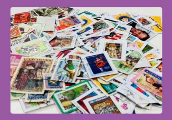
Stamp collecting workshop for kids (ages 9+ years) at Chatswood Library