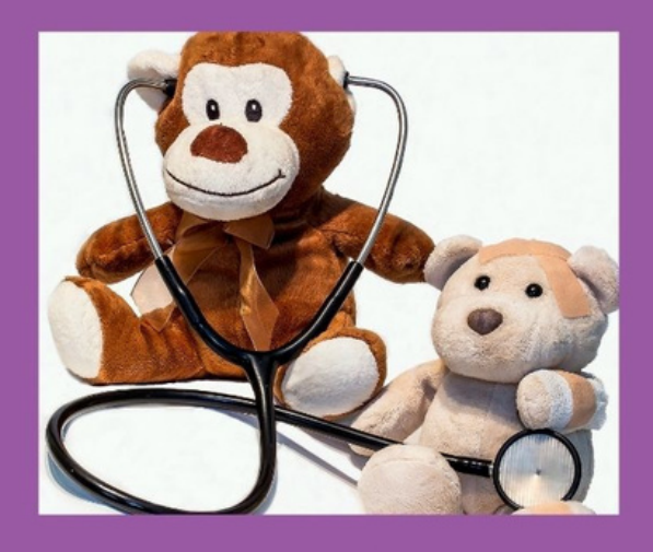
Teddy Bear Hospital (For ages 5-7 years). A cute and cuddly introduction to healthcare for children at Chatswood Library.