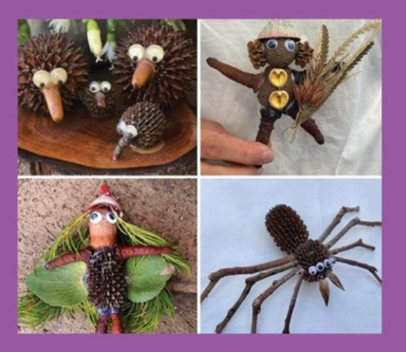
Nutty native crafts! (8-13 years) at Artarmon, Northbridge, Castle Cove and West Chatswood Libraries.